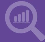
Loan Comparison Sites